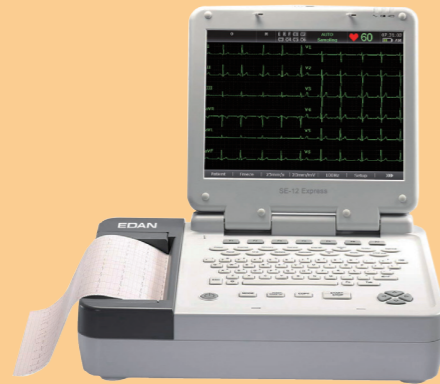
SE-12 Express Electrocardiograph